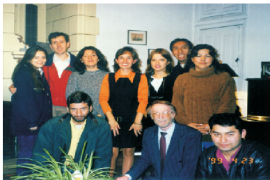
Part of the career group

Son of Man's Mission P.O. Box 747 Bremerton, WA 98337